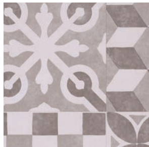
NAT601/NAT601-C ORNAMENTAL DECOR-JAZZ (V4)