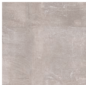
NAT606/NAT606-C CONCRETE-CAPONE (V2)