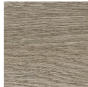
NAP702/NAP702-C REFINED OAK-DAPPER (V2)