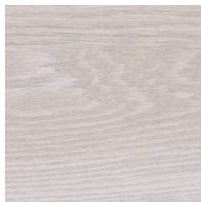
NAP703/NAP703-C REFINED OAK-BEARCAT (V2)