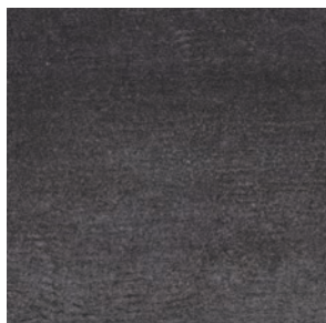
NAT604/NAT604-C CONCRETE-SLAMMER (V2)