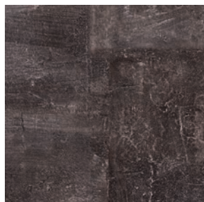
NAT605/NAT605-C CONCRETE-METROPOLIS (V2)