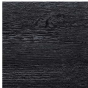
NAP701/NAP701-C REFINED OAK-GATSBY (V1)