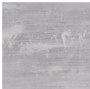
NAT603/NAT603-C CONCRETE-PROHIBITION (V2)