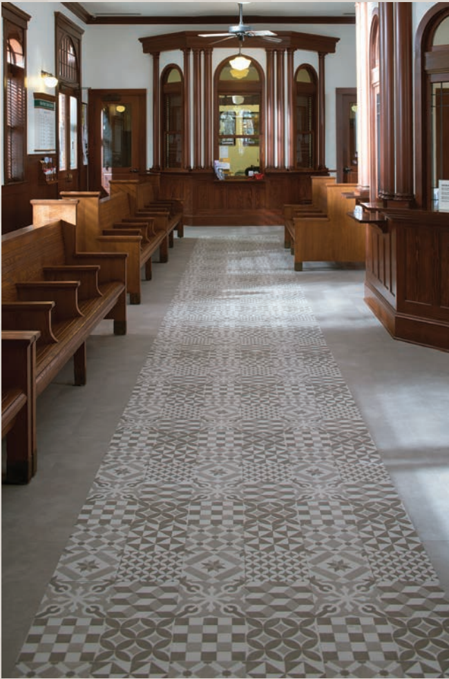
Shown: Abberly™ Ornamental Décor-Jazz and Concrete-Prohibition Tile