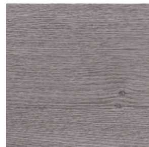
NAP704/NAP704-C REFINED OAK-SALOON (V2)