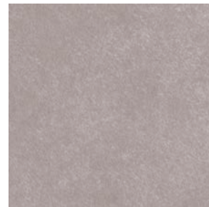
NAP706/NAP706-C ORNAMENTAL DECOR-SUPPER CLUB (V4)