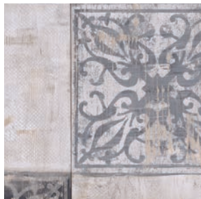
NAT602/NAT602-C ORNAMENTAL DECOR-SPEAKEASY (V4)