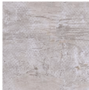
NAP705/NAP705-C AGED WOOD-BREW (V2)