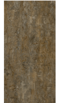
Distressed Concrete-Houston (V2) NDT802