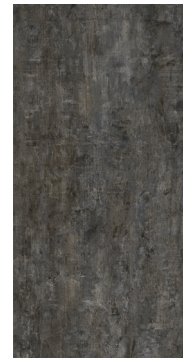
Distressed Concrete-Delancy (V2) NDT803