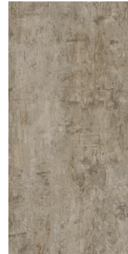
Distressed Concrete-Hudson (V2) NDT801