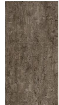
Distressed Concrete-Lex (V2) NDT804