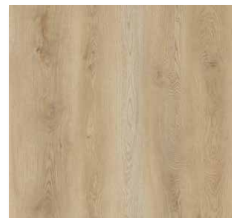
Classical Oak - Cambridge Rigid Core - NLP505-HDC (V2) Glue Down - NLP105 (V2)