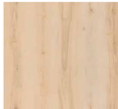
Apple - Fuji Rigid Core - NLP510-HDC (V3) Glue Down - NLP110 (V3)