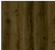
Classical Oak - Hampton Rigid Core - NLP508-HDC (V3) Glue Down - NLP108 (V3)