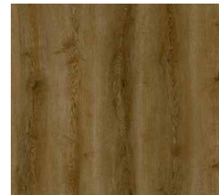
Classical Oak - Durham Rigid Core - NLP507-HDC (V3) Glue Down - NLP107 (V3)