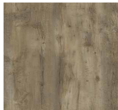
Provincial Oak - Richmond Rigid Core - NLP504-HDC (V3) Glue Down - NLP104 (V3)