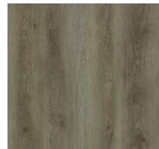
Classical Oak - Rushmore Rigid Core - NLP506-HDC (V2) Glue Down - NLP106 (V2)