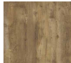
Provincial Oak - Williamsburg Rigid Core - NLP501-HDC (V3) Glue Down - NLP101 (V3)