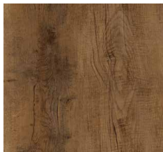
Provincial Oak - Charleston Rigid Core - NLP502-HDC (V2) Glue Down - NLP102 (V2)