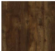
Provincial Oak - Boston Rigid Core - NLP503-HDC (V3) Glue Down - NLP103 (V3)