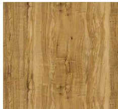
Apple - Caramel Rigid Core - NLP509-HDC (V3) Glue Down - NLP109 (V3)