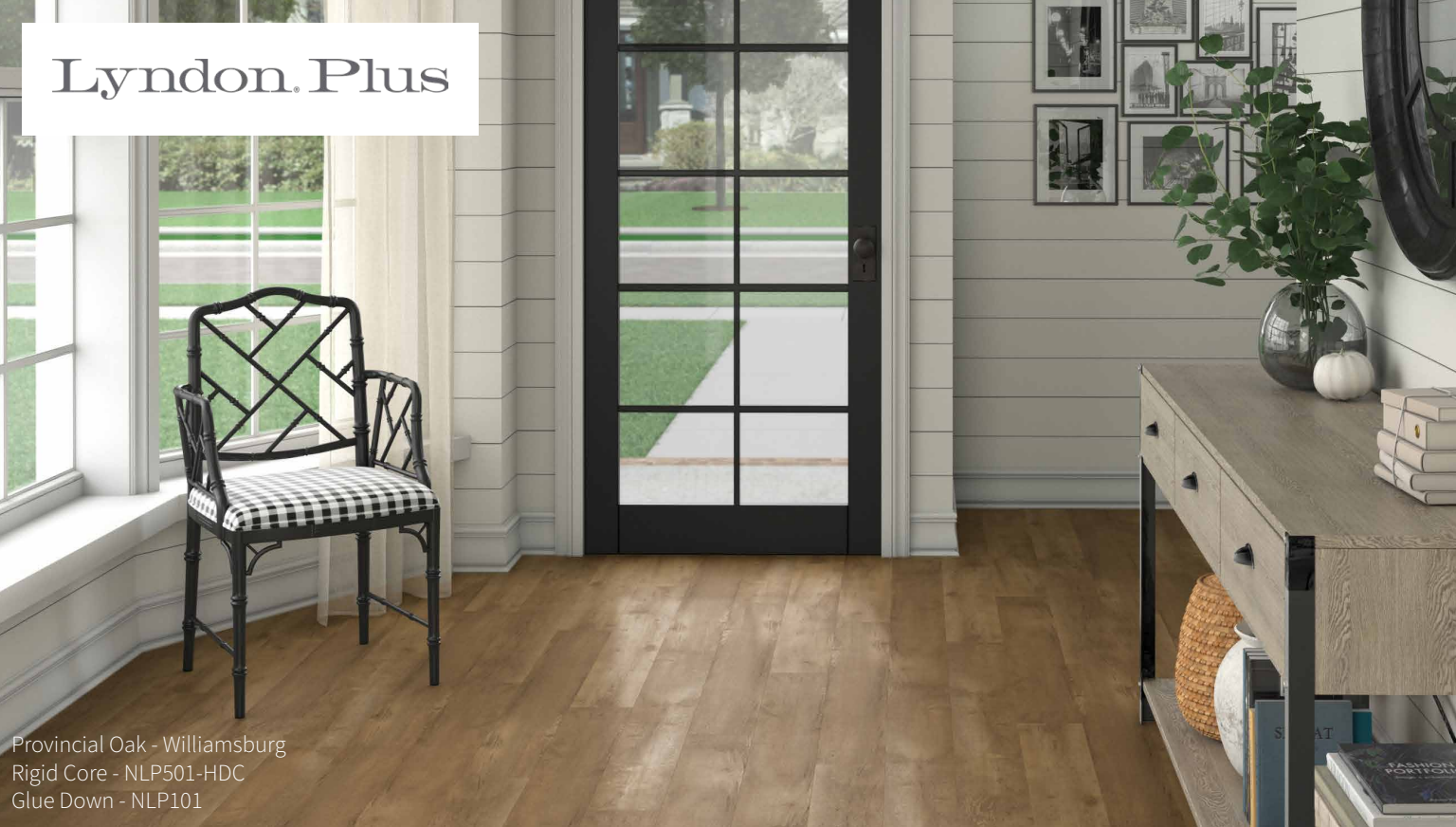
Provincial Oak - Williamsburg Rigid Core - NLP501-HDC Glue Down - NLP101